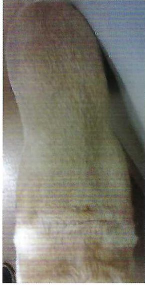
Standard imaging reveals no apparent signs of disease